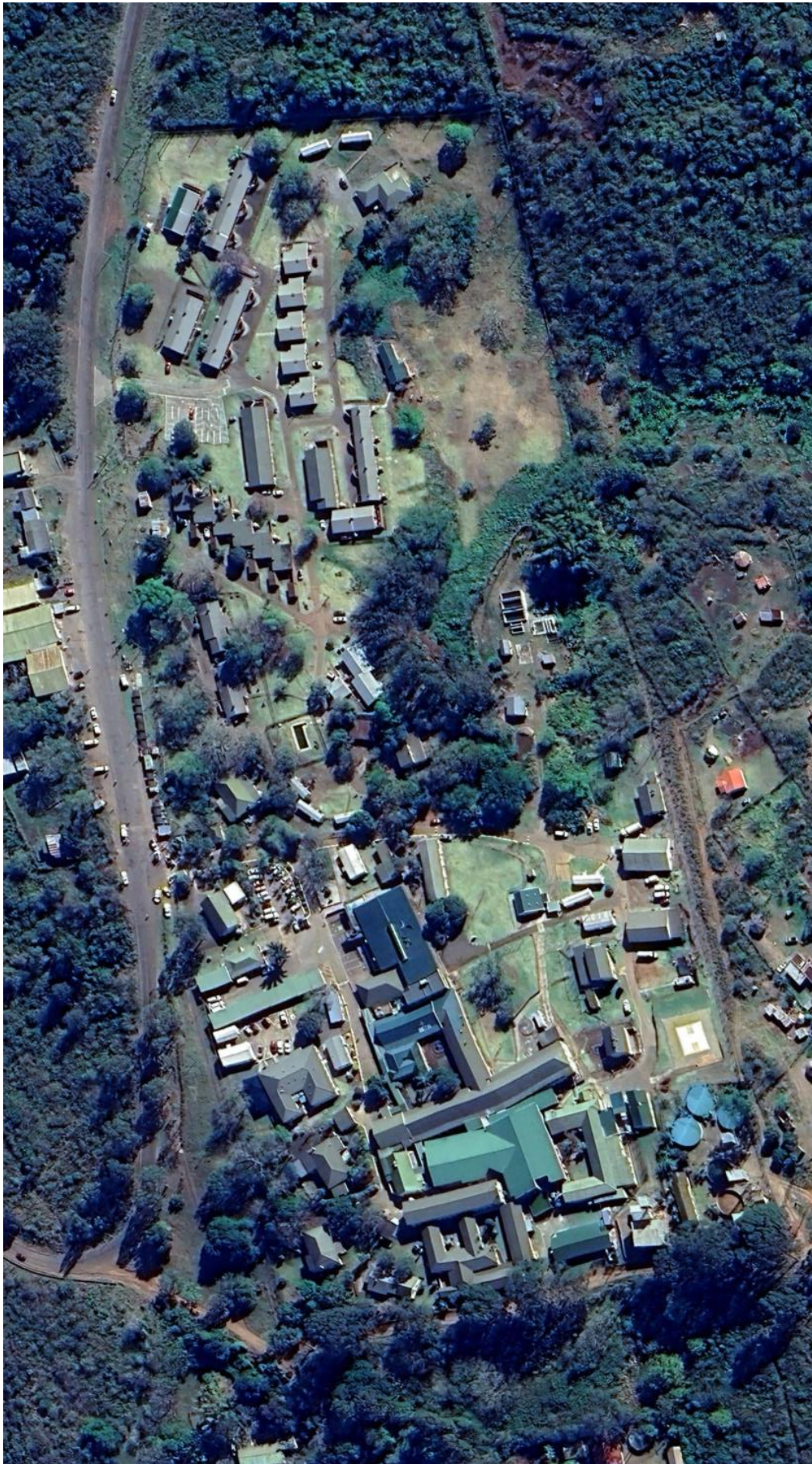
Figure 3: Bethesda Hospital Precinct