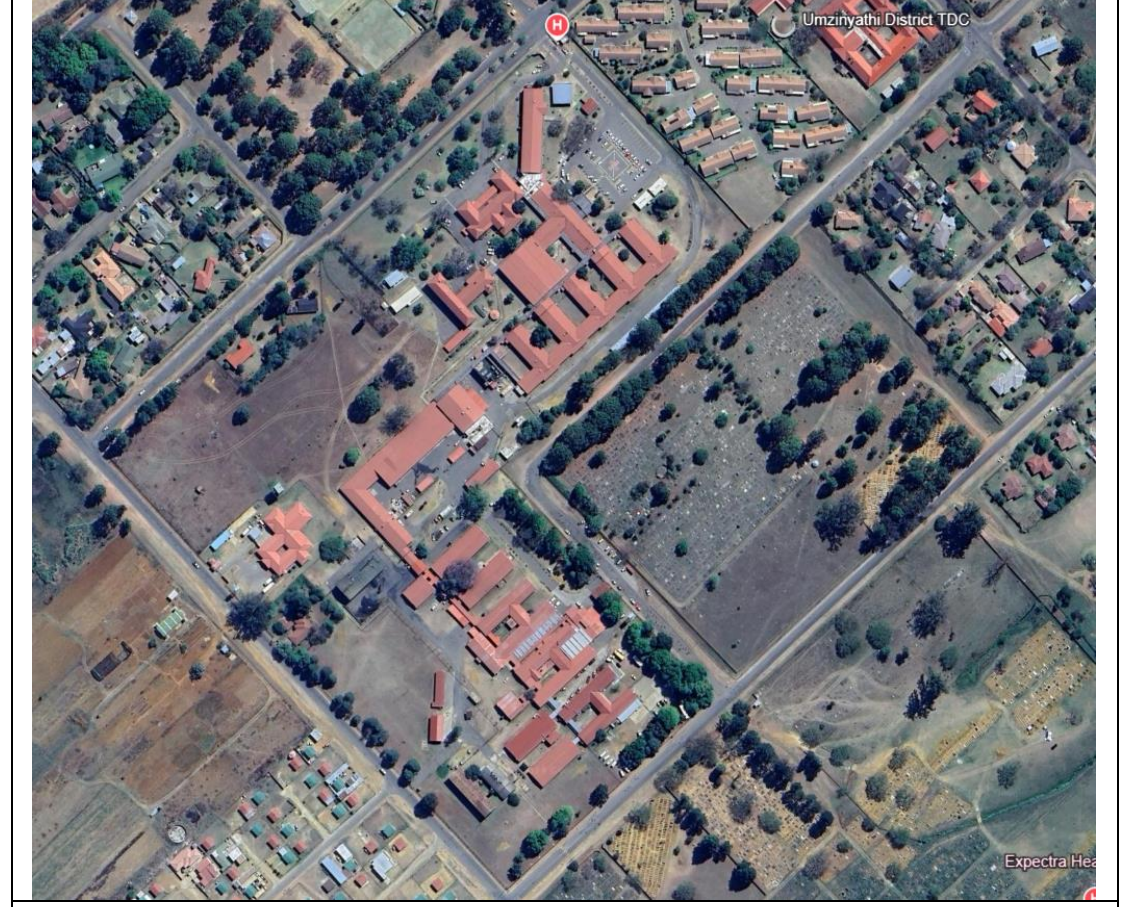
Figure 3: Dundee Hospital Precinct