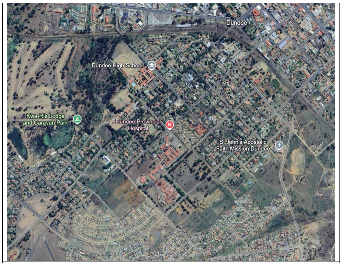
Figure 2: Dundee Hospital within the local context.