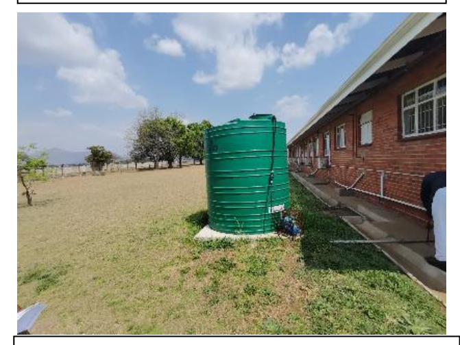
Photo 04 – Showing 'JoJo' tank storage with associated water pump and pipe connections.